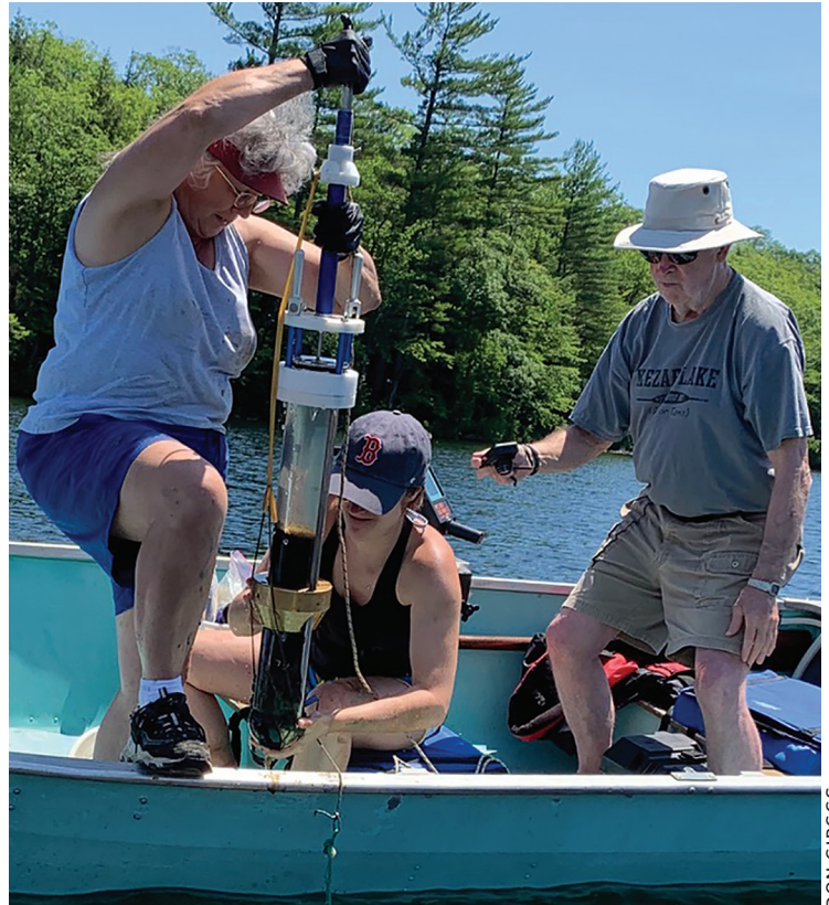
Core sample on Horseshoe Pond