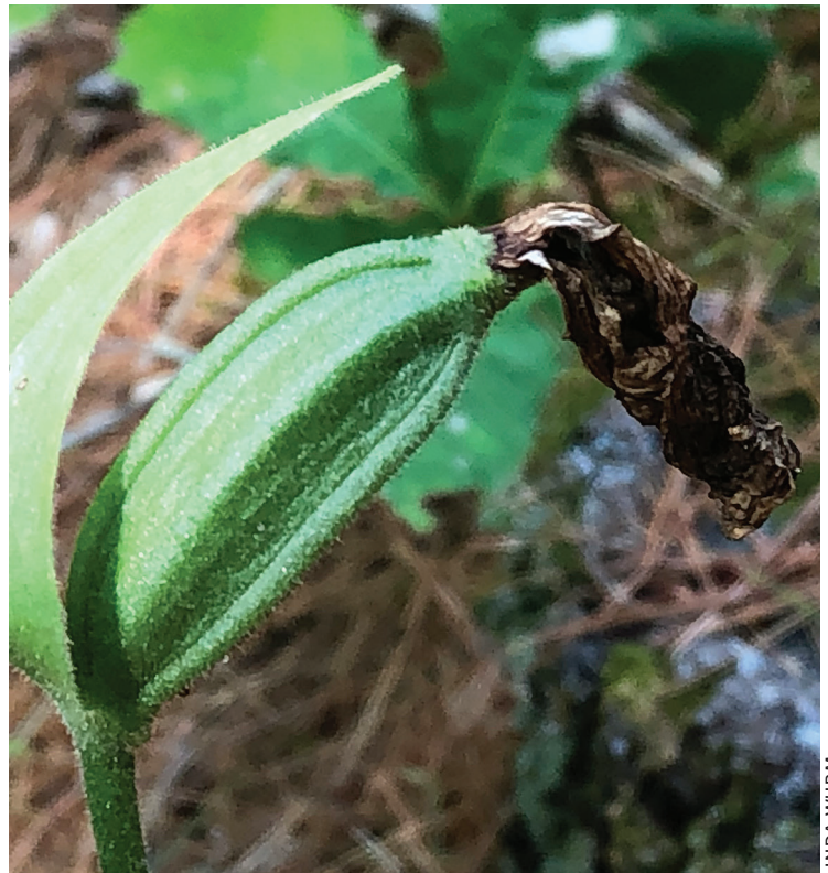
Contest Entry: Lady's Slipper seed pod