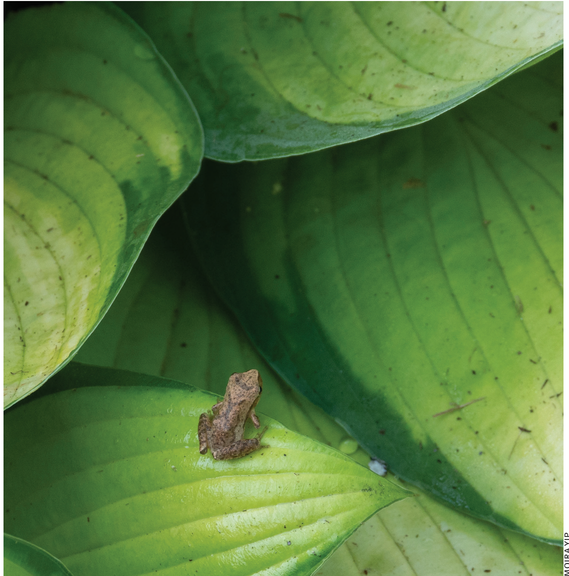
First place: Moira Yip's tiny spring peeper on hosta leaves

Volunteers begin by choosing a convenient plot for observation that can be as small as a single dandelion plant, or as large as a nearby acre of mixed habitat. Observers watch over their plot to see what happens, recording phenomena such as bud